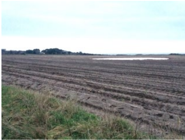
Ness House from Landfall Site showing natural pond.